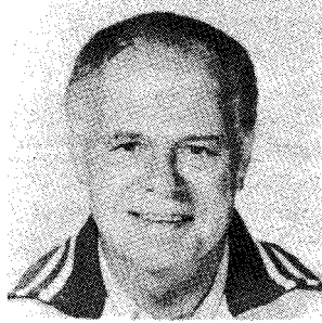
Jud Heathcote Michigan State